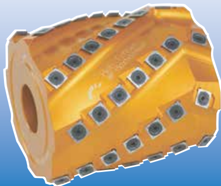
"Heli Timber" Planer head

3 to 5 times longer lifetime than uncoated tools. Long-lasting sharp cutting edge and better cut surface.